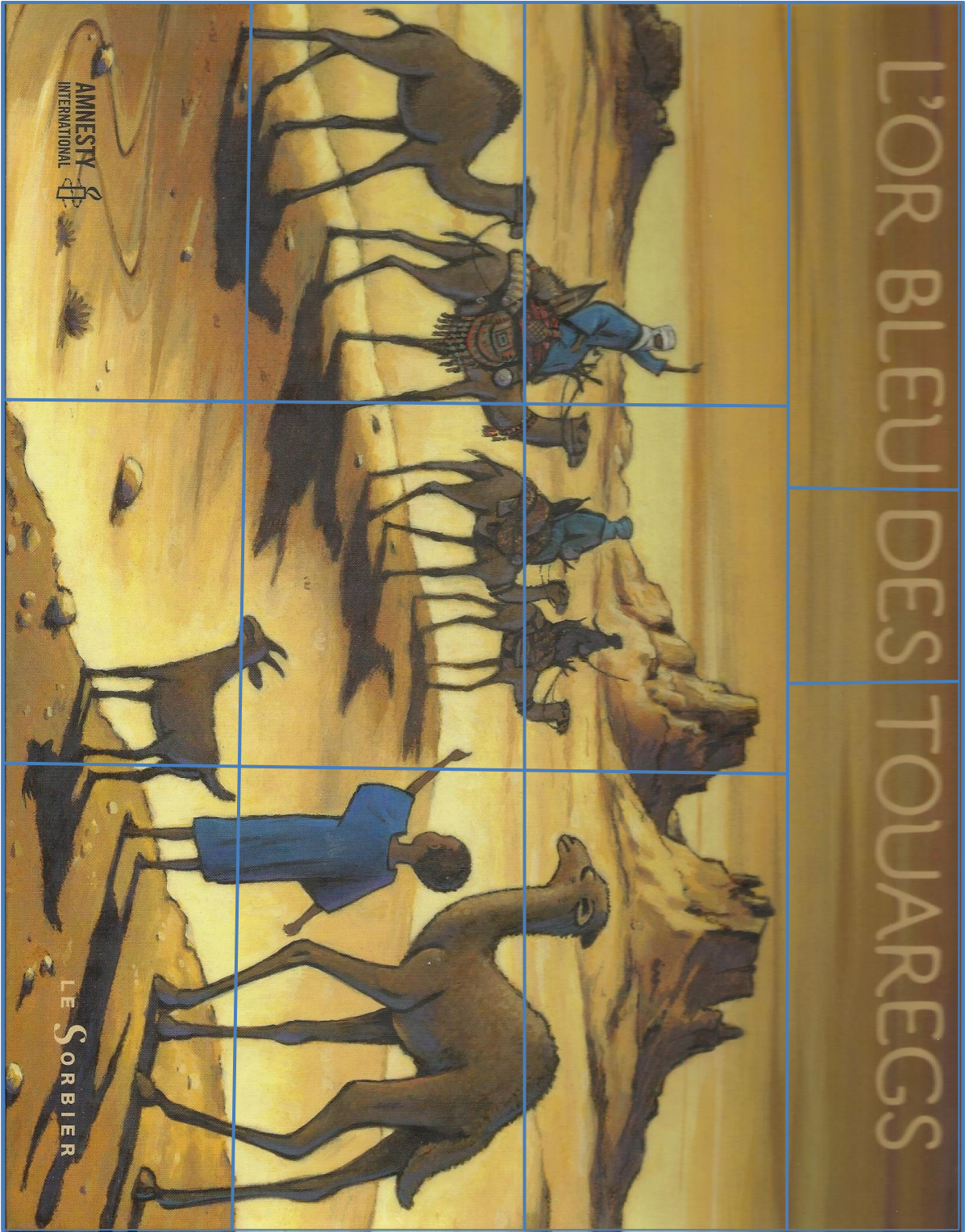
Puzzle de la couverture gs